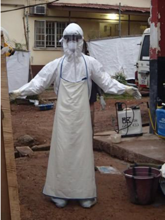
Fig 3 Healthcare worker in personal protective equipment at an Ebola treatment centre in Sierra Leone, 2014